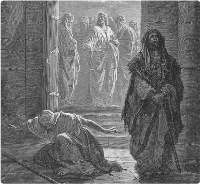
Pharisee and Tax Collector • Luke 8

Coming closer to our Lord changed his heart. We need to make corrections for the wrongs we've done as Zacchaeus did. Apologizing to others for the hurt we caused, returning the stolen material, uncovering a lie we told are all examples of corrections of wrongdoings and are signs of strong repentance.